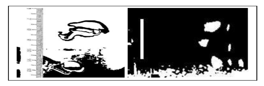
Figure 2 Sample Image of Bubbles Produced from Bubble Diffuser (left) and Membrane Diffuser (right) by using "ImageJ" software

Typically, to determine the effective contact area between the algae suspension and the inlet gas feed, it was important to evaluate the size of the bubbles produced by both the bubble diffuser and the membrane diffuser as well as the total amount of bubbles that they produced over a certain period. Therefore, a few images of the bubbles being produced by the bubble diffuser and membrane diffuser together with ruler as a scale were captured as shown in Figure 2 and these images were then analyzed by using the 'ImageJ' software to determine the bubble size.